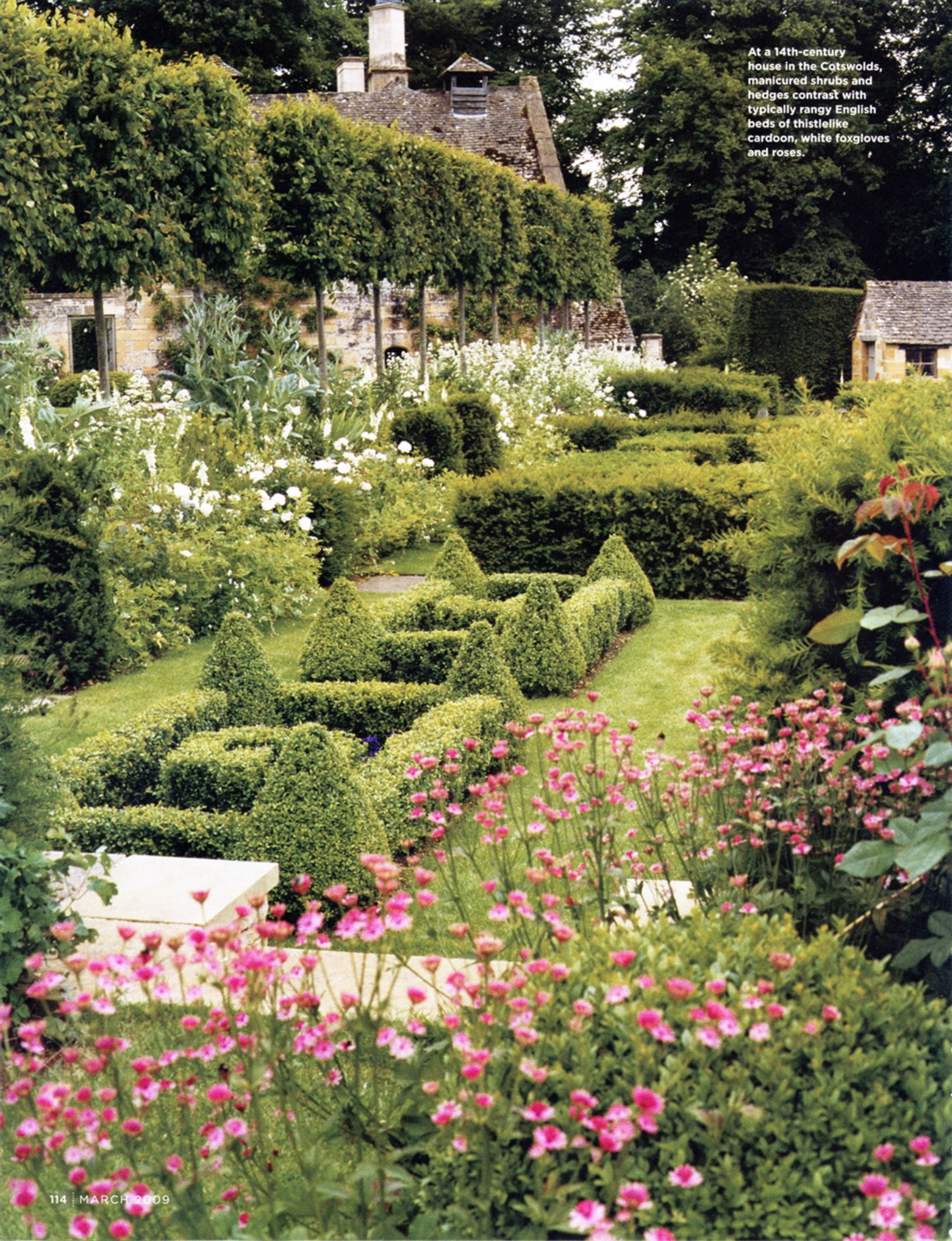
At a 14th-century house in the Cotswolds, manicured shrubs and hedges contrast with typically rangy English beds of thistlelike cardoon, white foxgloves and roses.